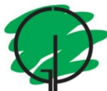
Greatworth Primary School

You are warmly invited to our Open Day events on